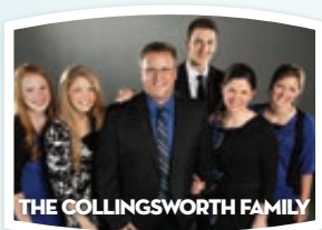
THE COLLINGSWORTH FAMILY

Booth Brothers are Gospel Music's "Artist of the Year," known for high energy, humorous and touching concerts. They show His love, grace and forgiveness through the songs God has given them to sing.