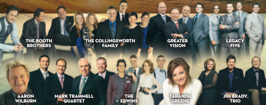
THE BOOTH BROTHERS