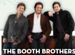
THE BOOTH BROTHERS

Andy Stanley is the senior pastor of North Point Community Church, Buckhead Church, and Browns Bridge Community Church located in the Atlanta, Georgia area. He is also the founder of North Point Ministries, and an accomplished author of inspirational books and study guides.